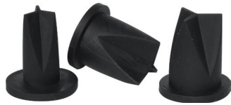
Check Valve Included