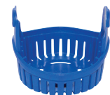
Strainer Base 1232R